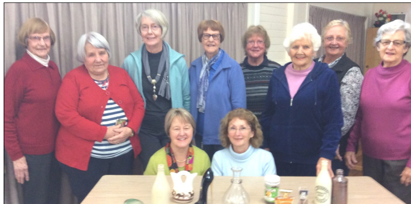
The Adult Fellowship group at their September meeting last Tuesday with their displays of bottles.